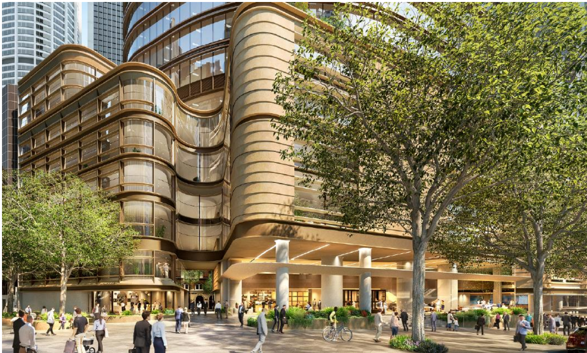
Figure 7: Indicative concept design of the through-site link looking through the future development towards Abercrombie Lane