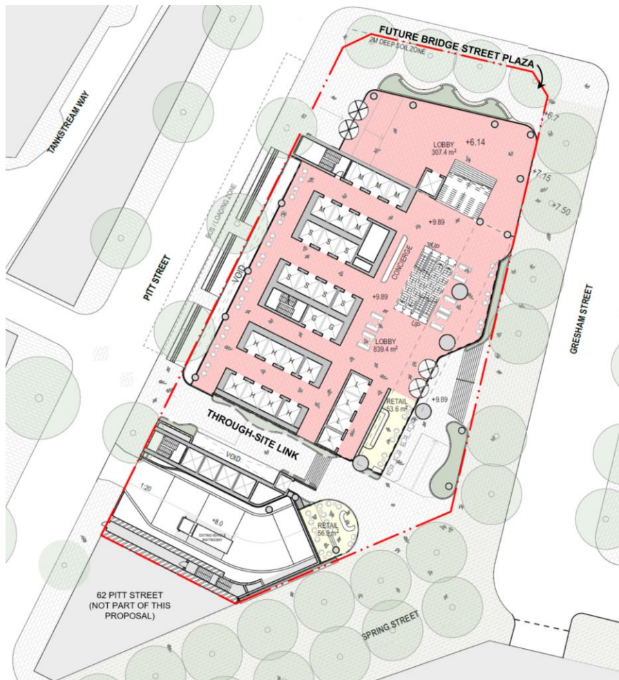
Figure 6: Indicative concept design detailing the ground floor, through-site link and Bridge Street Plaza