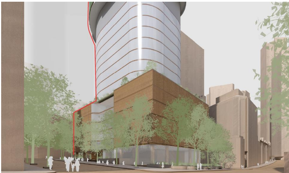
Figure 8: View of indicative concept design from Bridge Street showing tower indent zone