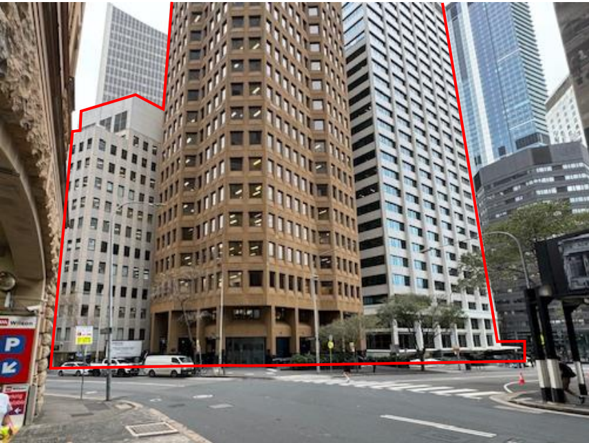
Figure 3: Looking west towards the subject site (in red) from Bent Street