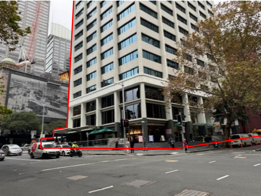
Figure 2: Looking south toward the subject site (in red) across Bridge Street