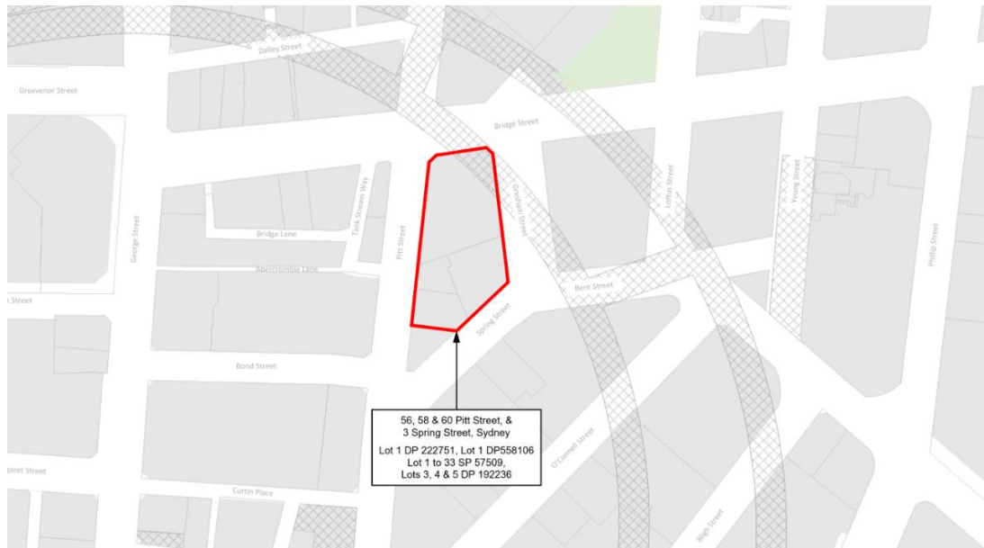
Figure 1: Land affected by this planning proposal