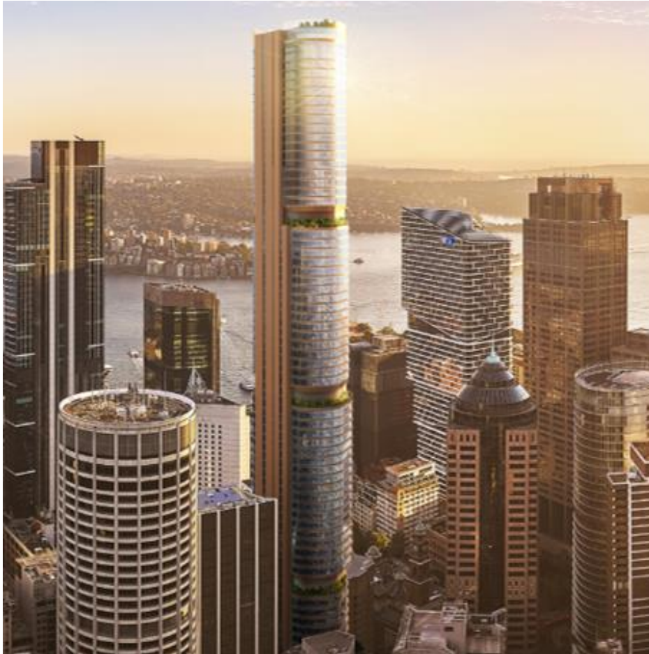
Figure 4: Photomontage of concept development